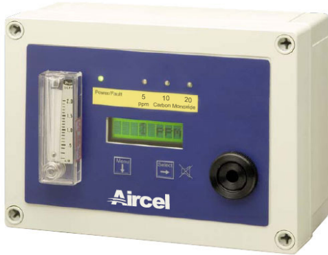
AMD-200 CO Monitor