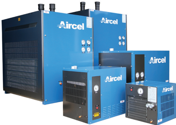
VF-10 - VF-1200

The Aircel VF Series (10 - 1,200 scfm) offers the highest efficiencies at varying flow conditions in a lightweight, compact design. No other dryer in the industry can offer the efficiency ratings achieved by the VF Series dryers in variable flow operation. VF Series dryers are built with the patented Variable Flow heat exchanger, which allows for desired dew point performance regardless of flow variations. Typically, other dryers with mechanical moisture separators lose performance as compressed airflow velocity increases or decreases substantially around the nominal design point.